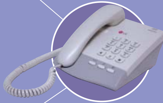
LG SLT Handset