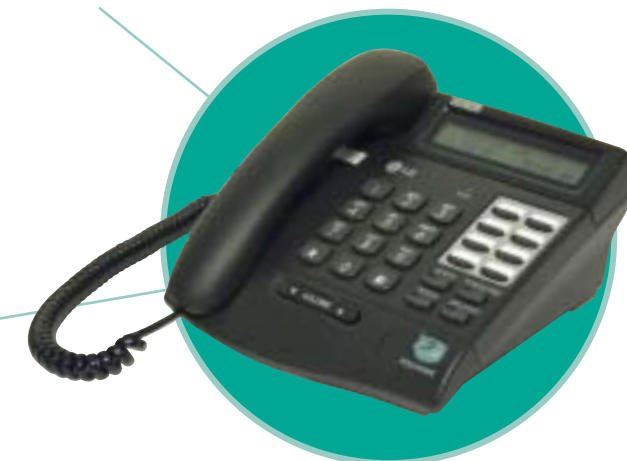
LG LKD 8 Button Handset