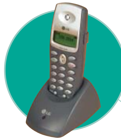
LG DECT Handset

"LG Electronics operates in 120 countries and owns 37 manufacturing sites."