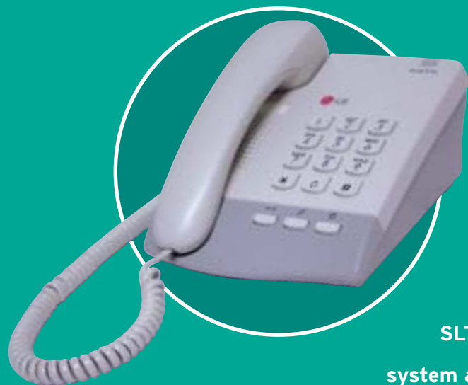
LG LKA-100 SLT Handset

Standard analogue telephones offer a simple and cost effective solution for any working environment.