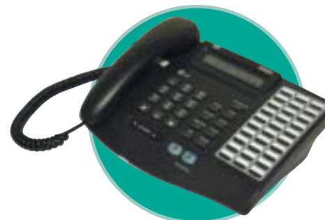
LG LKD 30 Button Executive Handset