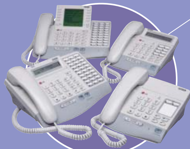
LG LKD Digital Handsets